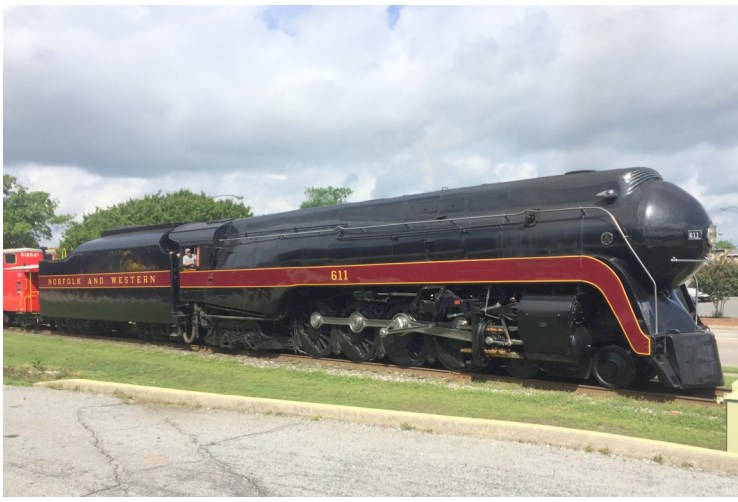
Left: the N&W #611 built in May 1950 - one of the last J Class steam streamliners (owned by the Virginia Transportation Museum but pictured here at the NC Transportation Museum)