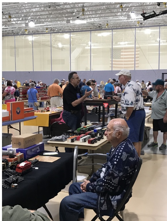
Fort Pierce meet photos from the Fenn Center, March 25, 2017